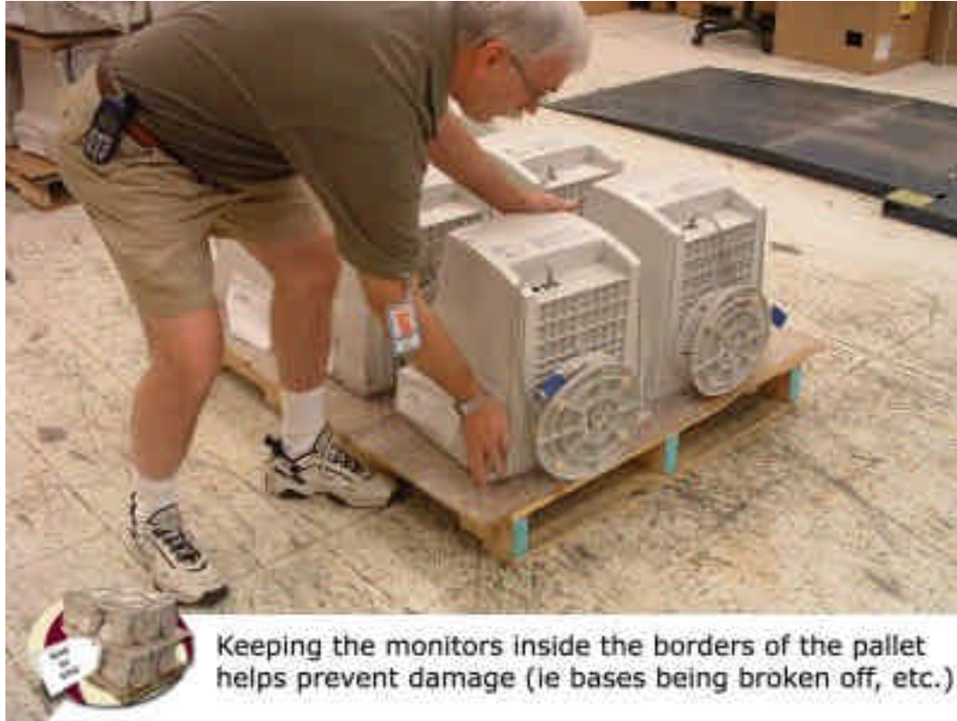
Keeping the monitors inside the borders of the pallet helps prevent damage (ie bases being broken off, etc.)

View this Guide Online: http://www.csileasingservices.com/info/